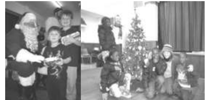
Kids and Adults were joined by Santa at the PPNA Holiday Party, with gifts and sweet treats galore!