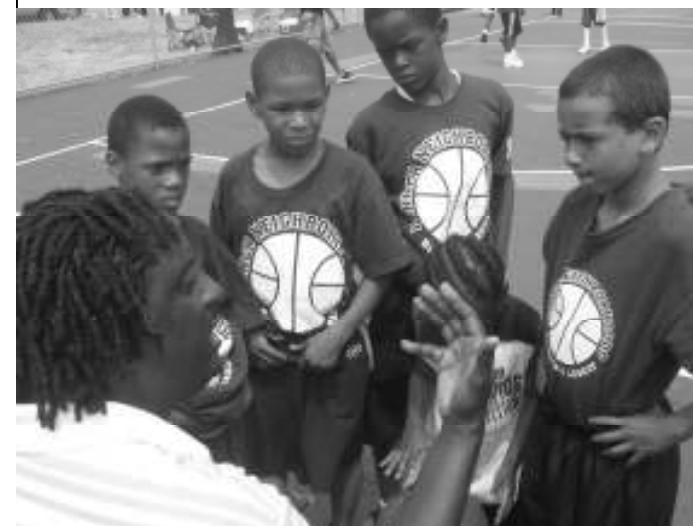
Youth players strategize with their volunteer coach

Banner's Youth Basketball League is starting soon! The league accepts boys and girls between the ages of 8 and 13. The season begins in March and ends in June, with practice one night a week and games every Saturday at William Paca Elementary/Middle. We need adult volunteer coaches! For a time commitment of 2 hours a week, you can make a big difference in the lives of young people in the neighborhood. Even if you have never coached or don't know much about basketball, you can be a big help just by showing up and helping other coaches. If you're interested in coaching or if you know young people who like basketball, please contact us at (410) 585 - 8810, or by email at info@bannerneighborhoods.org